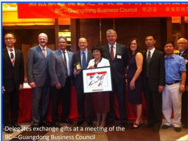
Delegates exchange gifts at a meeting of the BC—Guangdong Business Council

IPG and YXS continue to work in deep partnership to promote the transportation hub at Prince George. The investment in infrastructure at the airport and the Air Logistics Park has set the stage for future growth and diversification in the city. Both agencies took the opportunity during the trade mission to advise air carriers and logistics companies of recent developments, including: construction of the Boundary Road connector; the open source fuelling depot and cross-dock facility at the airport, and; the expansion of CN's intermodal facility which will almost double capacity by January 2012. These and other developments will continue to support the rapid growth of Prince George as an "inland port".