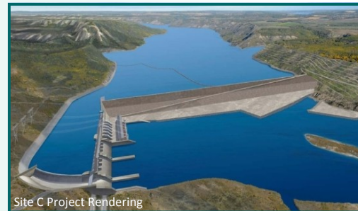
Site C Project Rendering

For more information and to access the directory visit: www.bchydro.com/sitec