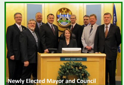
Newly Elected Mayor and Council

We also wish to express our appreciation to all other candidates who participated in the election.