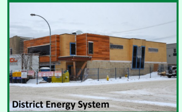
District Energy System