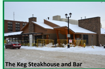
The Keg Steakhouse and Bar

Work continues on the new RCMP Detachment on Victoria Street, set for completion in 2013. Permits for more than $30M in downtown construction and renovation projects were issued by the City of Prince George throughout 2011.