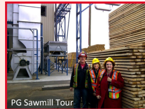
PG Sawmill Tour