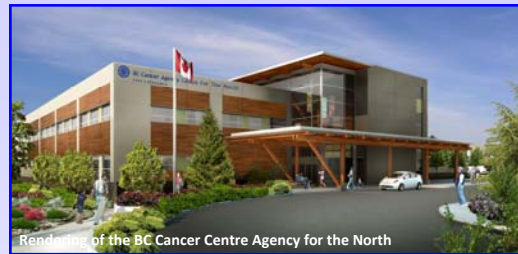
Rendering of the BC Cancer Centre Agency for the North

The Centre for the North will be the BC Cancer Agency's sixth regional centre, and will include a chemotherapy unit, outpatient clinics, and two linear accelerators which will deliver radiation therapy in Northern BC.