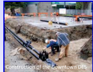
Construction of the Downtown DES

Work has begun on the construction of the Downtown District Energy System (DES). The Downtown DES will utilize the system already in place at Sinclair Group Forest Products' Lakeland Mills operation to generate hot water to provide heat to several downtown buildings.