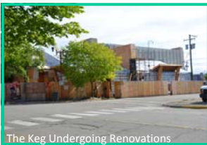
The Keg Undergoing Renovations