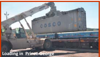
Loading in Prince George