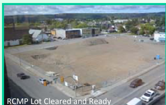
RCMP Lot Cleared and Ready