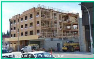
Seniors Complex Construction